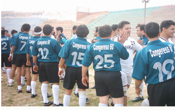
Congress players before their match with Esfahan Province