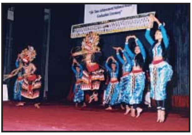
Sri Lankan cultural performance at the Mithuru Mithuro Movement Graduation Ceremony.