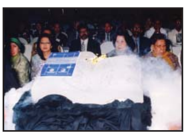
CPDAP's publication "A guidebook on minimum standards -Management of Drug Treatment and Rehabilitation Programmes in Asia" launched in the conference.