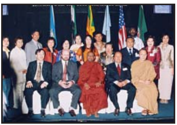
Thai delegation at the Conference.