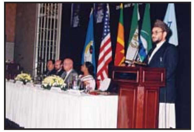
Hon. Sulaiman Hamid, Deputy Minister Haj and Awqaf, Islamic Government of Afghanistan, addressing the audience in the inauguration ceremony